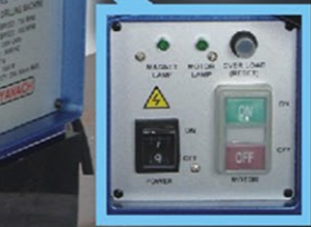
Reversible Switch Panel.